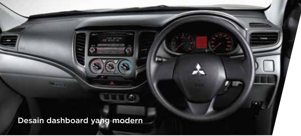
Desain dashboard yang modern